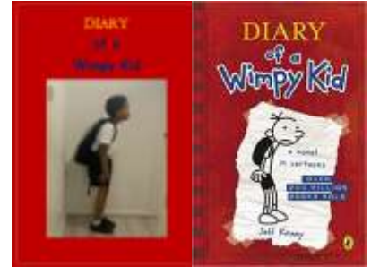
4O'S - Ismail