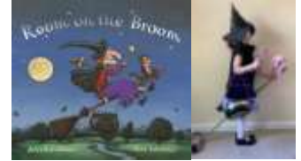
1G - Elisa