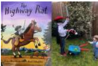
2M - Peter