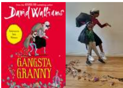
5G - Aadya