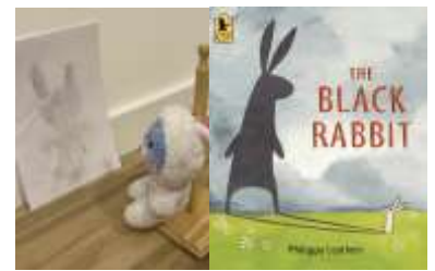
4K - Hana